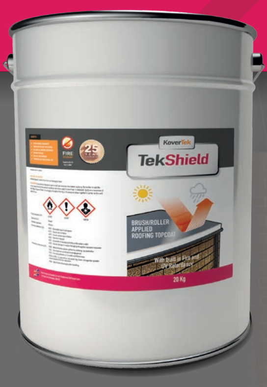
* TekShield offers a 20 year (450g) CSM or 25 year (600g) CSM Material Guarantee when installed correctly, please contact us for further details of the Guarantee conditions.

Designed specifically for roofing applications where a high coverage is required with a universal cure profile. Produced as standard in RAL 7011 Grey with excellent batch to batch colour consistency (Other colours are available subject to min order). The product is designed to give high UV resistance with good coverage rates. Can be applied with brush/roller.